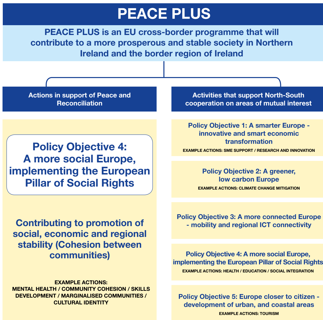
Figure 1: Policy Objectives that can be funded under PEACE PLUS

In the case of Peace and Reconciliation activities funded by PEACE PLUS, these will be funded under Policy Objective 4.